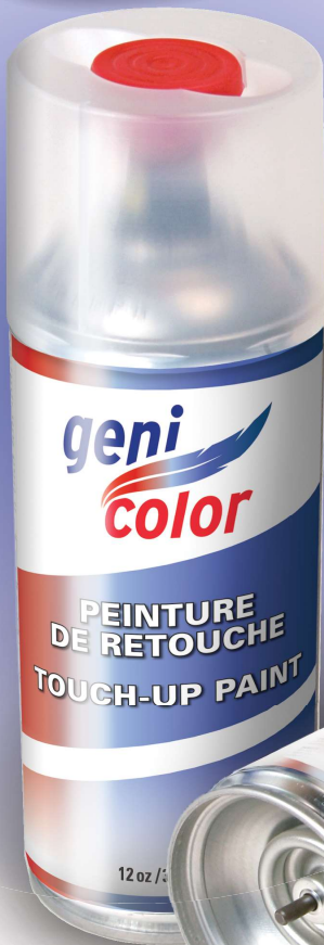
Contains 12 OZ

SAVE BY AVOIDING EXPENSIVE TRIPS TO THE AUTO-BODY SHOP